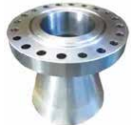
Socket Weld Flange(SW)