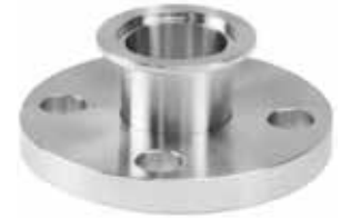
Lap Joint Flange(LJ)