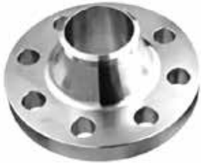
Weld Neck Flange(WN)

Depending on the type of connection between the tube and the flange, these can be divided into the following basic types: